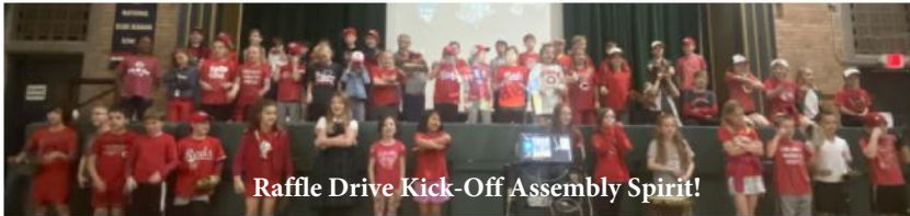
Raffle Drive Kick-Off Assembly Spirit!