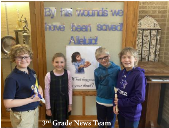
3 rd Grade News Team

Back from the break and energized for the Easter Season! Springtime activities gear up as we head into the last six weeks of the school year.