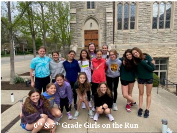
6 th & 7 th Grade Girls on the Run