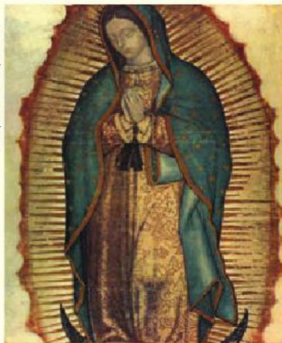
The image of Our Lady of Guadalupe, from the tilma of Juan Diego.

When Mary next appeared, she filled Juan Diego's tilma (a traditional garment) with roses, though they were out of season. When Juan Diego opened his tilma in the bishop's presence, the roses fell to the ground and the bishop sank to his knees. On the tilma appeared an image of Mary exactly as she had appeared at the hill of Tepeyac. It was December 12, 1531.