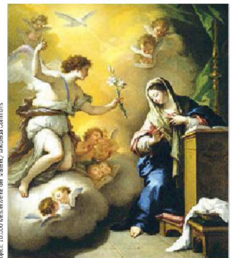
The Annunciation, Paolo de Matteis