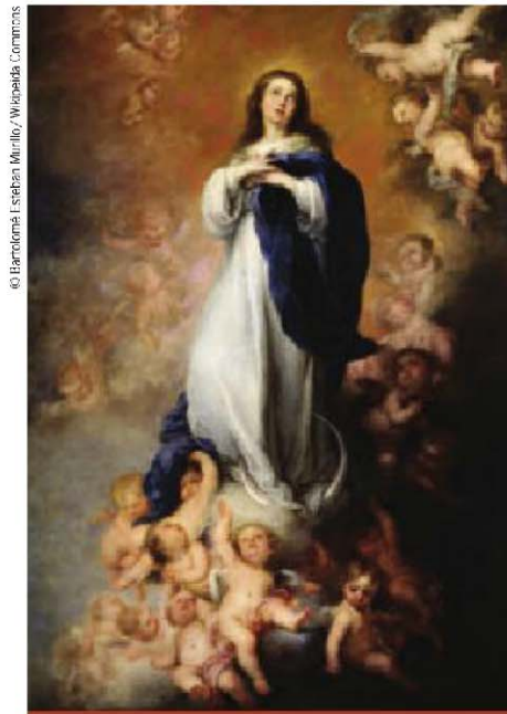
The Immaculate Conception, Bartolome Estaban Murillo, Prado, Madrid.

Much as we understand intuitively that there was something different about Mary that made her more open to doing the will of God than any other human beings after Adam and Eve, so we intuitively know that because of her intimate connection to Jesus, she would not suffer the same death that all humans endure before the promise of the resurrection.